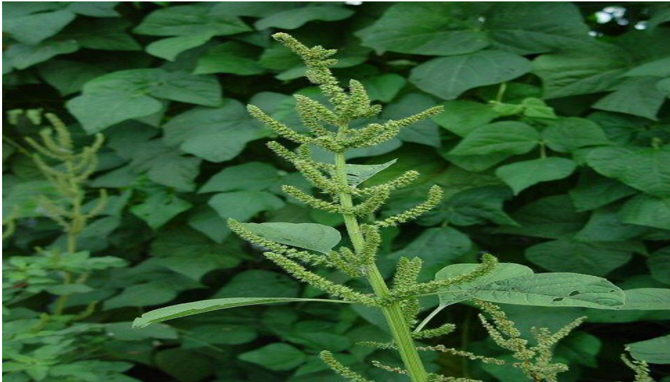
Figure 2: Amaranthushybridus