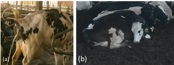
Fig. 3. A cow urinating (a) and a cow in its lying position (b) [16] [17].

4) Ergonomics - Animal movement and resting positions: The default positions assumed by the cow while resting, excreting and moving could not be ignored while designing a PLF sensor system. Figure 3 shows a cow urinating and a cow in its resting position.