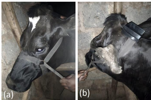
Fig. 11. Fitting of cow harness (a) and positioning of sensor system atop the harness (b).

This position allowed for fairly consistent readings as the sensor was firmly held in place. However, key challenges arose when the animal tried to assume a resting position. When lying down, the sensor system caused some discomfort to the cow as it was too big and pronounced. Furthermore, when the animal defecated or urinated, waste material easily splattered onto the sensor system. Due to this, the system was immediately removed from this position, and no readings were obtained. Figure 11(a) shows the fitting of the harness on the animal while figure 11(b) shows the positioning of the sensor system on the top of the harness.