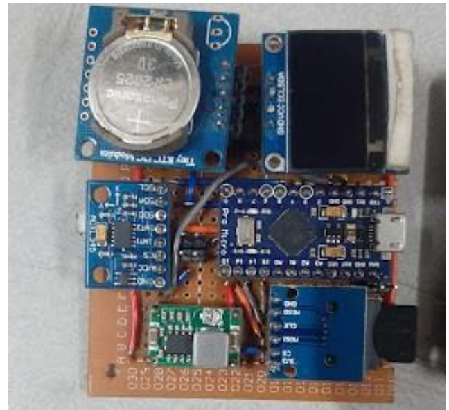
Fig. 4. The components of the PLF sensor system

To limit errors arising from attempting to send data, a local SD card shield was utilized with a memory card housed on the tag. A Real Time Clock (RTC) system was included to ensure the system kept record of time, and a 0.96 inch OLED display was utilized to allow for easy debugging. The various components were assembled as shown in Figure 4.