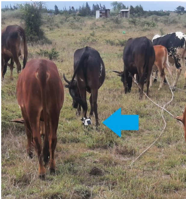
Fig. 10. Sensor system attached to hind leg of cow

In this position, attachment is relatively easy and does not constrict the cow. The small diameter of the cow's leg means a smaller strap is needed for attachment, and thus the cost is lower. This region was considered because of the presence of a thermal window allowing for temperature measurement as well as the ease of monitoring movement using the pedometer system attached to the leg