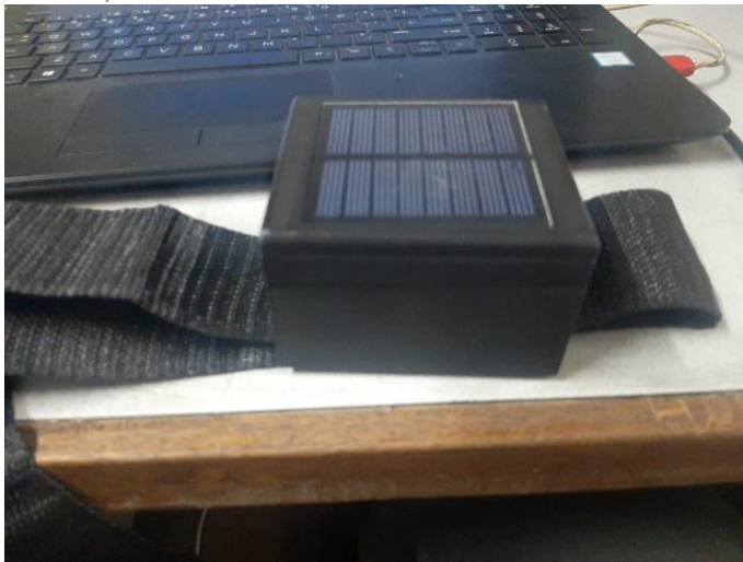
Fig. 6. The neck tag

For positioning on the leg, a different shape had to be adopted. The tag was designed to fit around the leg ergonomically by having a semi-cylindrical extension that could easily wrap on the animal's foot. Furthermore, the tag utilized the flexible TPU material to allow for it to contort and assume the actual shape of the leg. The tag was 3D printed as shown in Figure 7.