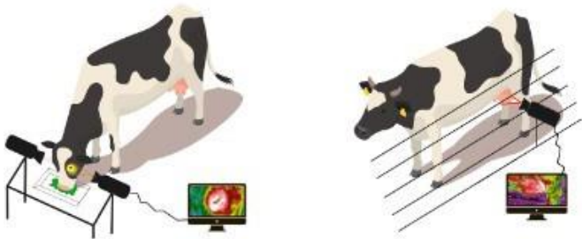
Fig. 1. Remote thermal imaging to detect cow temperature in a cow pen [5]

These sensors can be located in different places, whether on the individual animal or off and around the entire herd. Where the sensors are placed off the animal, they are placed in well-mapped out areas such as feeding and resting sheds where the animal is known to assume a particular position at given times of the day. This method is less preferred since it only allows for measurements to be made at specific times of the day when the animal is feeding, sleeping or being milked. Furthermore, the physical range of measurement of the sensors being utilized has to be significantly higher to obtain accurate measurements as the readings are made over a distance of 1 to 10 meters. An example can be seen in Figure 1 showing thermal imaging in a cow pen.