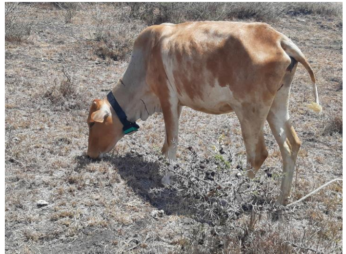
Fig. 8. Sensor system attached to neck of cow

Figure 8 shows attachment of the sensor system to the cow's neck.